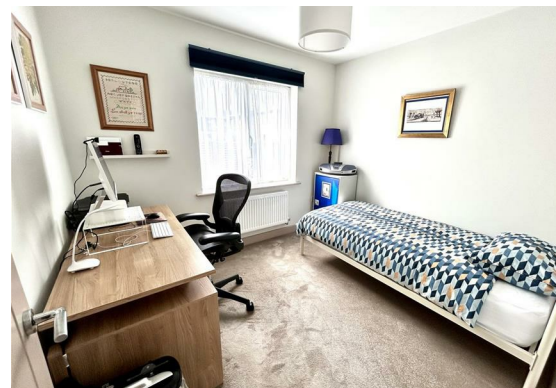
Master Bedroom 17'8" x 9'11" (5.38m x 3.02m)